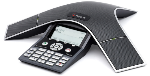
Polycom IP 7000 Premium conference room phone – ideal for mid- to large-sized rooms

GTA features Polycom IP phones to power your business. Polycom is known industry-wide for its superior voice quality and handset design.