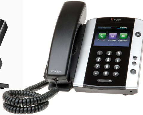
Polycom VVX 500 12 line, color screen - a terrific mid-range device