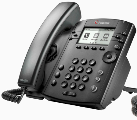
Polycom VVX 300 6 line, Monochrome screen for utility applications